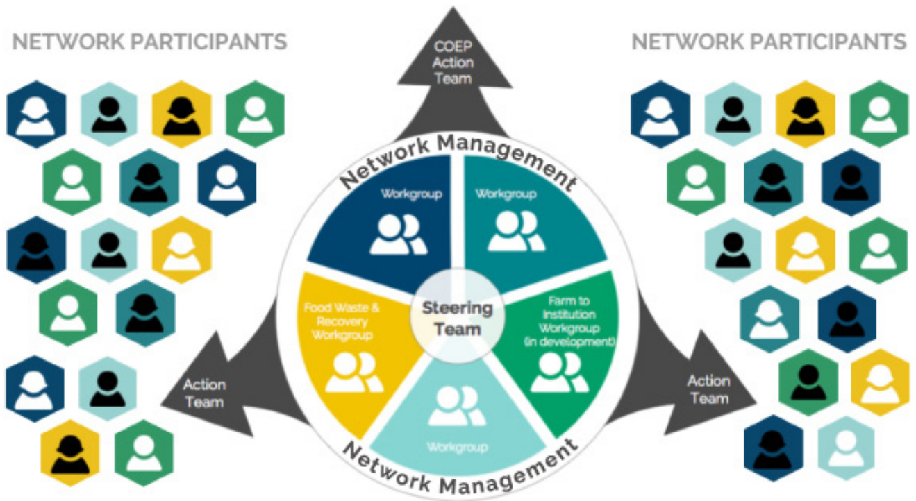
Community ownership, Empowerment, and Prosperity Action Team.

In 2014, funding from the Town Creek Foundation was secured to develop the Chesapeake Foodshed Network. Many leaders, resource experts, and funders provided significant guidance and support in the development of the CFN's governance structure, programs, and services (Appendix B. Governance & Program Development Thought Leaders 2014-2017).